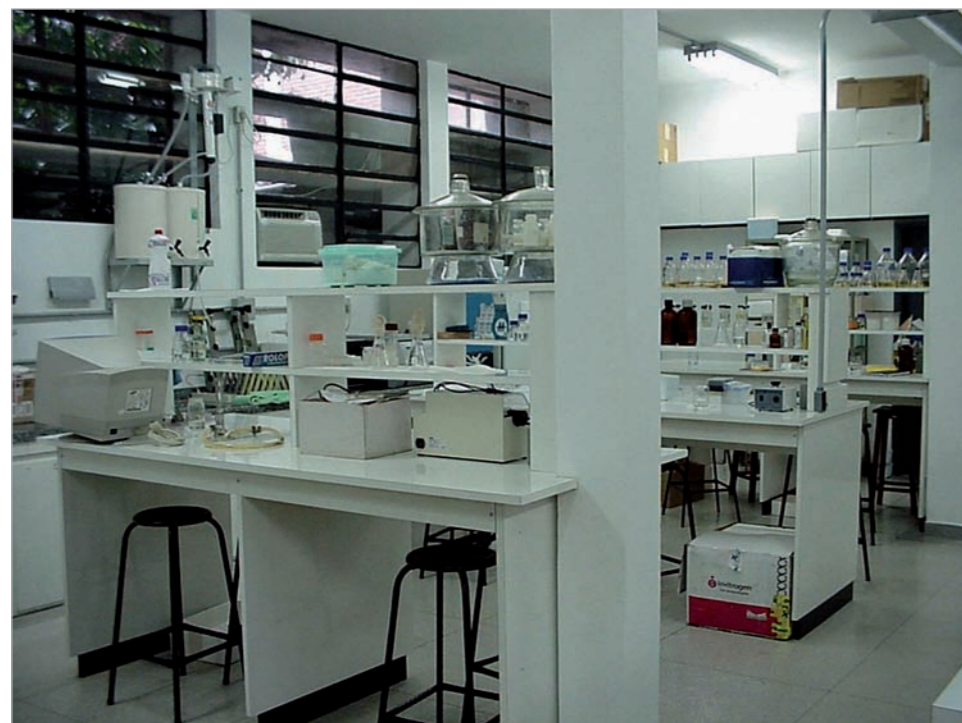
The laboratories of CBME integrate top technologies in molecular biology, biochemistry, protein crystallography and medicinal chemistry

The common issue on the research projects of CBME is the molecular approach, in atomic detail, of biological systems related to demanding areas of society, such as human health, agriculture, and environment. The team members are researchers with solid formation and background in different aspects of molecular and structural biology. CBME's mission is to develop high-quality basic research in strategic areas for the country. The current main projects are related to endemic infectious diseases in Brazil, like Chagas' disease, leishmaniasis, schistosomiasis, yellow fever, malaria, and diarrhea. Other projects investigate proteins associated with cancer like septins, tubulin, Nek kinases and nuclear receptors; genetic diseases (Shwachman-Bondian-Diamond syndrome); anti-inflammatory drugs; plant-pathogen interactions; matrix metalloproteinases; disintegrins; myotoxins; and neurotoxins from Brazilian snake venoms; biological models of inflammation; and cellular signaling. The CBME research organization adopts a matrix arrangement, in which the heads of projects utilize all the available facilities, competences and skills, according to the projects' needs, thus optimizing the chances to achieve the established goals. These extensive external collaborations enable CBME to cover all the demanded methodologies and specialized techniques on developing projects.