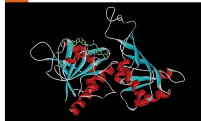
Crystal structure of the enzyme glyceraldehyde-3-phosphate dehydrogenase from Trypanosoma cruzi , one of the targets for anti-parasitic drug discovery at CBME

The major goal of the Center for Structural Molecular Biotechnology (CBME) is to perform both applied and basic research, as well as technological development in all areas that depend on Structure Based Molecular Design, specifically in the rational design of new structure-based compounds (drugs, vaccines, pesticides, herbicides) and in protein engineering. Our center promotes an integrated multidisciplinary approach including Molecular Biology, Biochemistry, Structural Biology, Medicinal Chemistry based on both Synthetic and Natural Product Chemistry, Molecular Immunology, Cell Biology and Pharmacology. Maximum integration and collaboration with the private sector is always sought, particularly with pharmaceutical and biotechnology companies and research institutes within the health and agricultural sectors. The integration of biological sciences with the facilities of the National Synchrotron Light Laboratory (LNLS) represents a major advantage for the center.